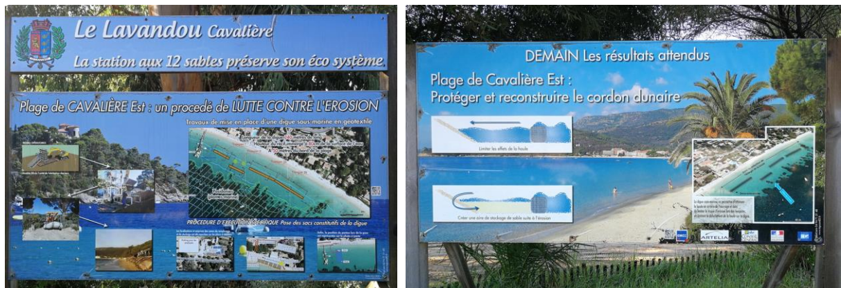
Figure 3: Example of erosion prevention measures presented publicly: public communication and education on coastal zone management is very important (Cavalière, Le Lavandou, France, A. Mlakar)

The problem of natural processes such as coastal erosion should be described. The erosion prevention measures – in order to protect natural/landscape features and human-made assets – can be a justifiable reason for the increased extent of human-made structures. An attempt could be made to assess the extent of the areas and locations where such measures are expected to be implemented.