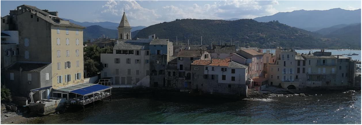
Figure 5: Old seafront town (Saint-Florent, Corsica, A. Mlakar)