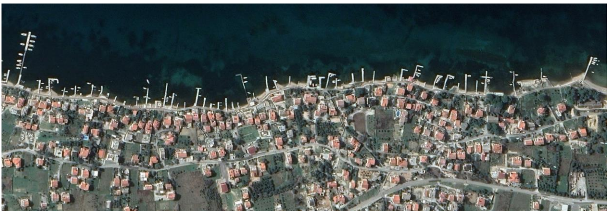
Figure 9: A single pier may not represent a major impact, but a whole set of them means a degradation of the entire coastline and makes it unattractive for bathers (Banjol, Rab Island, Croatia, Google maps, 2021)

In addition to assessing the size and share of structures, the analysis of their distribution is also very important. In some places, the extent of individual built structures may not be large but their high density gives the impression that a large part of the coastline has been ruined. The assessment should therefore also take into account the synergistic impact that arises when the impacts of several structures exceed the sum of their individual impacts. An active coastal management practice should ensure meaningful compaction or dispersion of such structures. It is also important to keep larger parts of the coast completely natural, with no human-made structures.