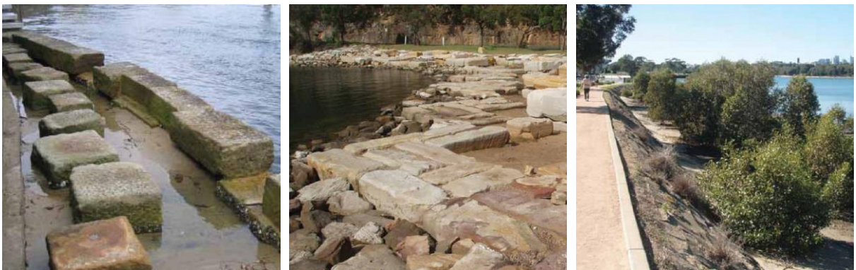
Figure 11: Examples of environmentally friendly seawalls (Environmentally Friendly Seawalls, 2009)