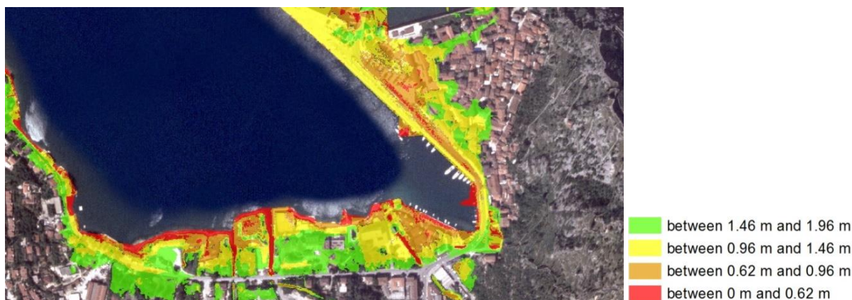
Figure 4: Sea-level rise analysis (Bay of Kotor, Montenegro, Harpha Sea, 2013)