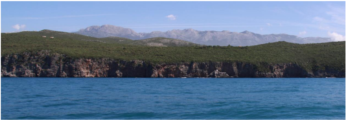
Figure 2: Steep natural coastline with no access to the sea (Platamuni, Montenegro, A. Mlakar)

The assessment of the ratio between the built-up and naturally preserved coastline should be placed in the context of coastal characteristics. Uninhabited islands contribute greatly to the share of the naturally preserved coast, and statistically compensate for the problem of intensive changes in other parts of the coast.