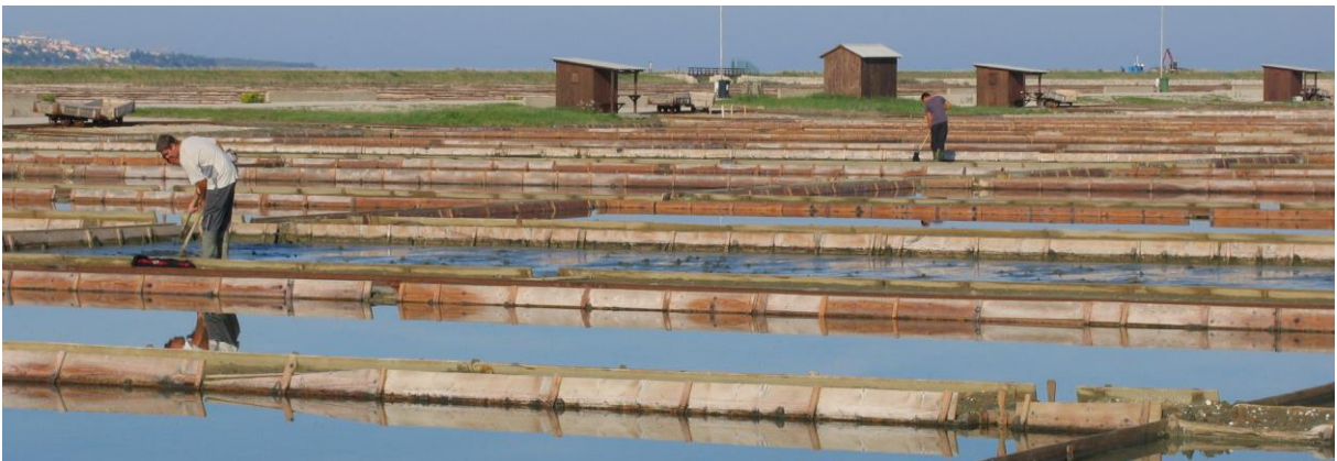
Figure 6: Traditional saltpan (Sečovlje, Slovenia)

Problems such as illegal construction, spontaneous individual building (instead of comprehensive and collective one), construction aimed at maximizing economic effects (without taking into account the public interest) could be considered, as well.