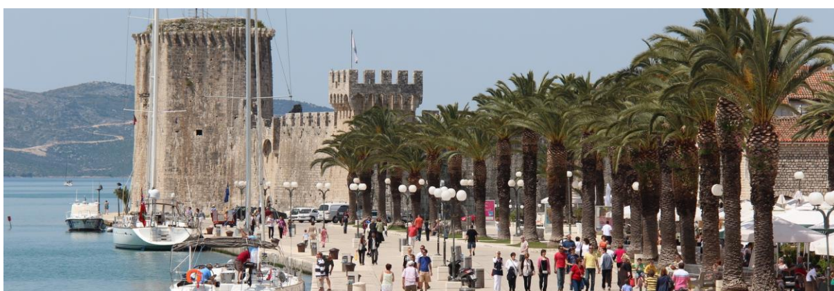
Figure 7: Waterfronts should be primarily for public use (Trogir, Croatia, M. Prem)

The description could be made of the past artificialization due to activities such as fishing, tourism, ports and harbours, and shipyards that had to be developed along the coast, and attention could be paid to (former) production, storage or military areas for which it would make sense to restructure and/or relocate to the hinterland, and thus relieve the coast or free up space for more suitable activities.