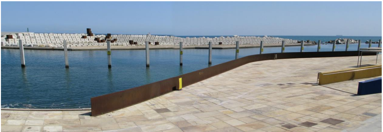
Figure 10: Landscape-architecturally shaped human-made structure (Parc dels Auditoris, Barcelona, A. Mlakar)

The adequacy of human-made structures, therefore, needs to be critically assessed. This does not mean that countries have to map or analyse individual solutions. The starting point is to monitor the situation within reasonable costs and time. However, one of the purposes of the Baseline status report and periodical assessment is to critically assess typical built or planned structures, i.e. to record bad solutions, learn from them and avoid constructing them in the future, and especially to recognize innovative solutions and use them as good practice to propose measures to achieve GES.